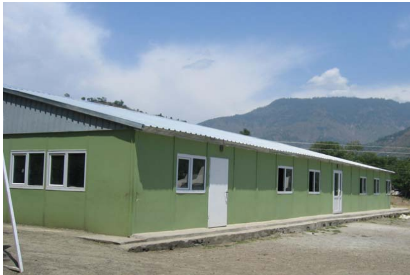
Light-construction (possibly pre-fabricated) school building in Sarasha village, 3 km northwest of Balakot.