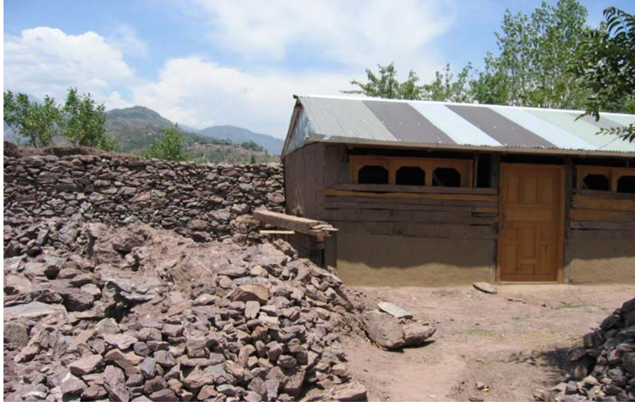
Reconstructed house on top of hill about 2km northwest of Balakot. The remains of a previous house are on the left. The foundation of the house is bedrock (Murrees formation), but it is on the “strip of destruction” along the hangingwall side of the thrust rupture. No significant modifications from what may be a traditional design were observed, except possibly the large windows covered by temporary planks. No attempt to tie the top of the 2m-tall walls was seen.