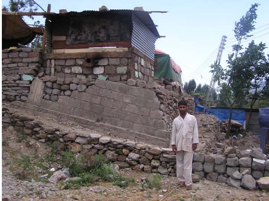
The strip of destruction through Sarasha Village, 3km northwest of Balakot. The cemented wall, the utility pole, and the trees were tilted 15 degrees by the fault rupture.